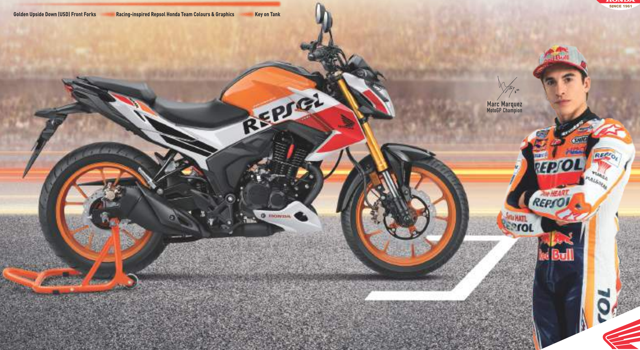
Marc Marquez MotoGP Champion

Golden Upside Down (USD) Front Forks Racing-inspired Repsol Honda Team Colours & Graphics Key on Tank