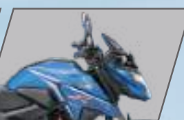
MATTE MARVEL BLUE METALLIC