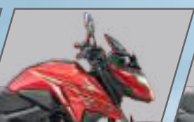
PEARL SPARTAN RED